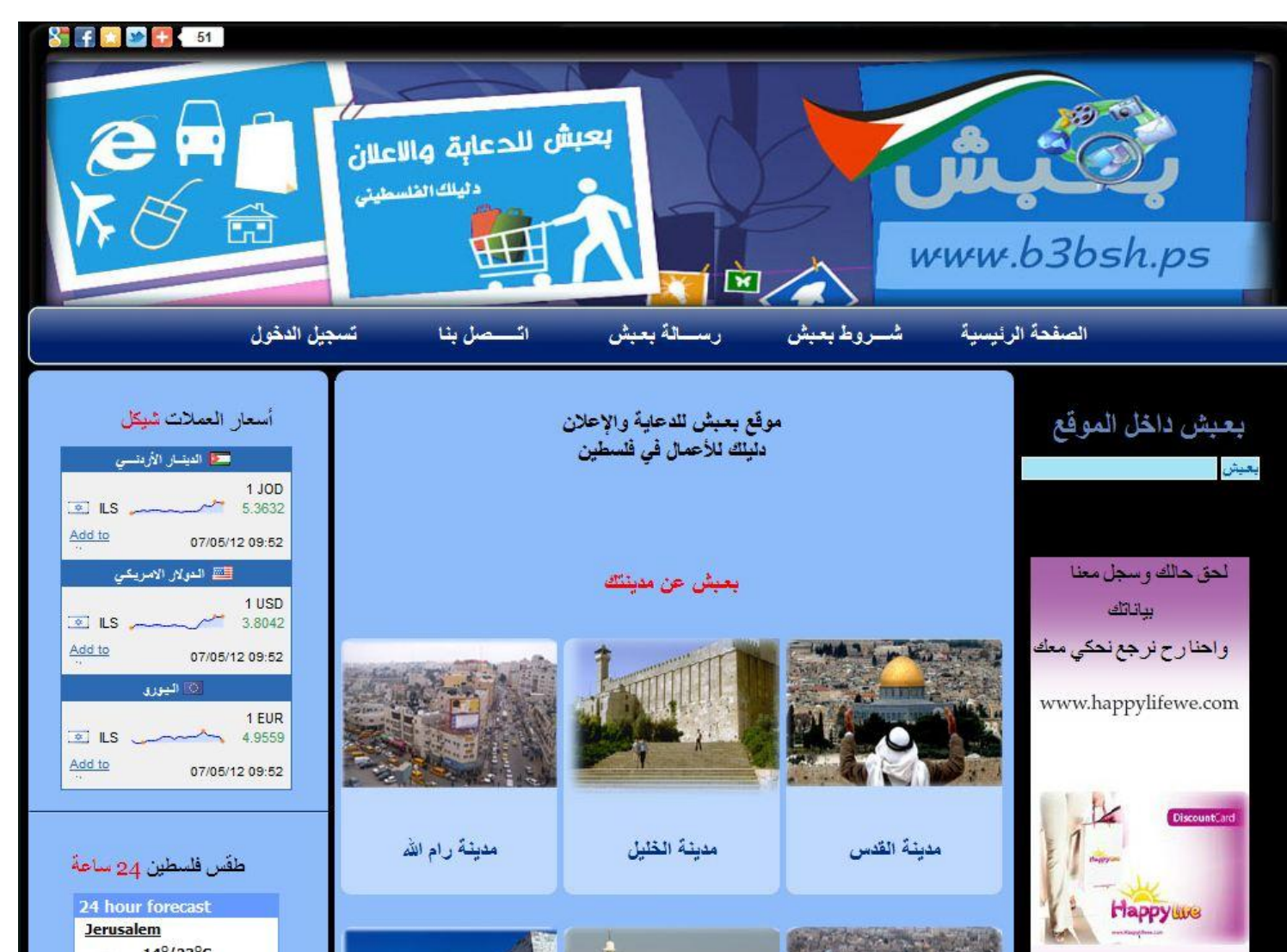
Figure 1: b3bsh Idea

In the frame of the Palestinian economical development and the diversity of its industrial, commercial, and services establishments, we turned to the project of site B3bsh. The project is a site which contains all Palestinian cities exhibited in a way which makes the visitor able to select, enter, and see what is from the inside from advertisements and presentations easily and without a little trouble. The advertisement page contains images and information that indicating the nature of the establishment or the facility within the Palestinian market.