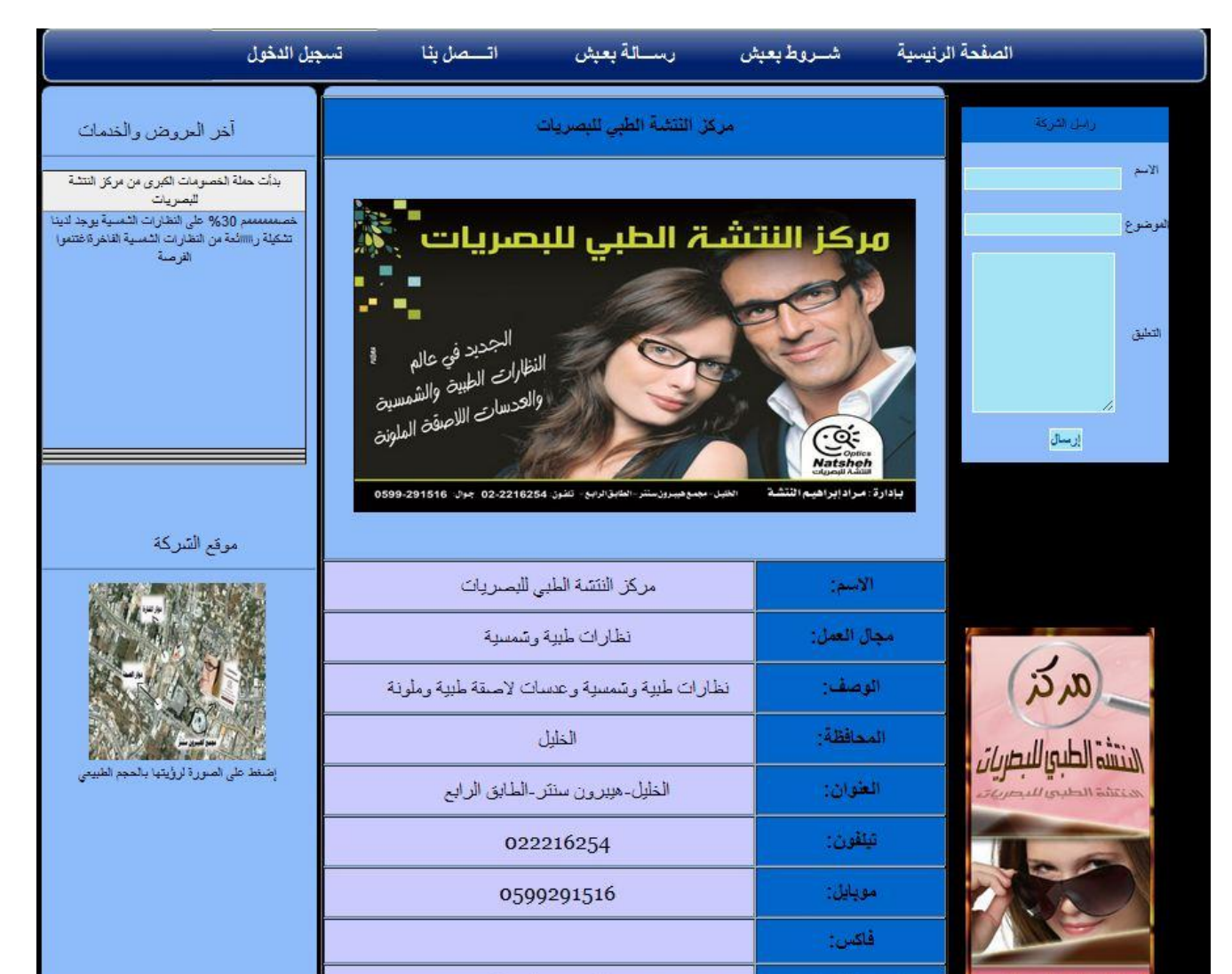
Figure 3: System Design Option

Web Design using software Dreamweaver And Photoshop and programming languages: Html – php – css – javascript